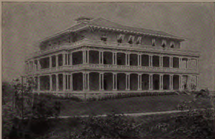
The Administration Building at Aucon